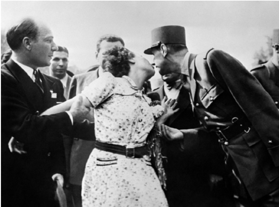
26 August 1944 - Paris, France - A Parisian woman kisses General de Gaulle, during a parade on the Champs-Élysées after Paris' liberation.