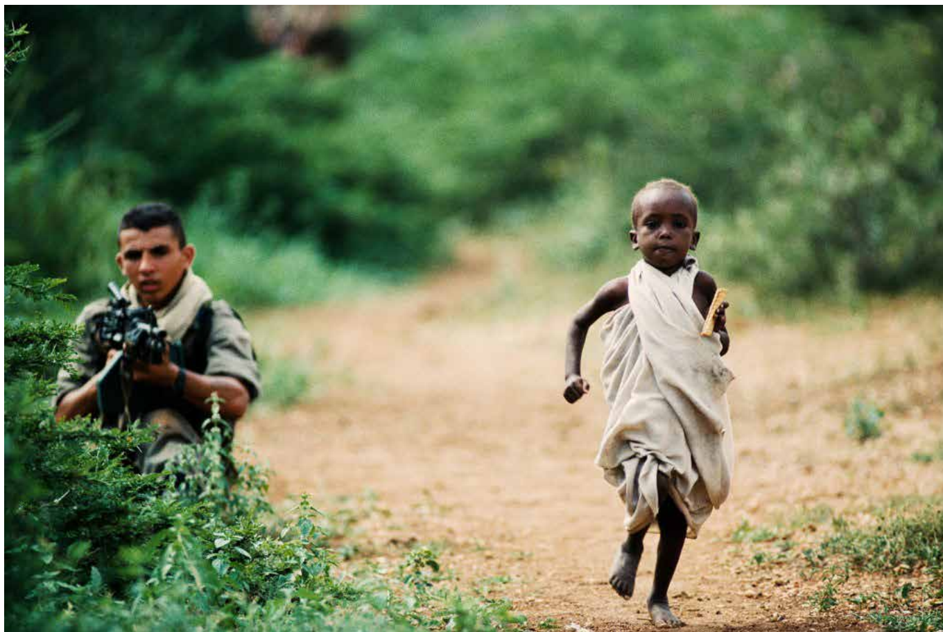
17 December 1992 – Baidoa, Somalia – A Somali child runs towards a relief convoy as a French legionnaire provides security for the transport of food supplies.