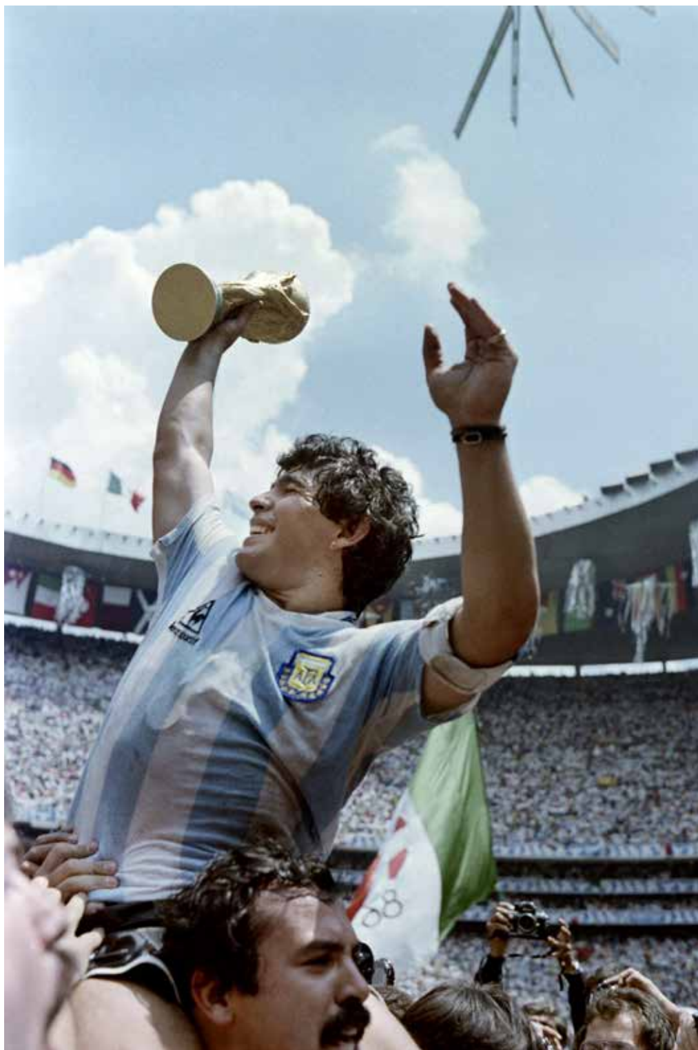
29 June 1986 – Mexico, Mexico – Diego Maradona holding the World Cup after Argentina's victory over West Germany in the finals at the Azteca stadium in Mexico City.