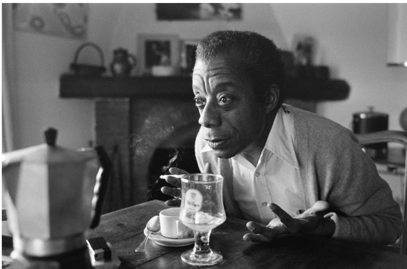
6 November 1979 – Saint-Paul-de-Vence, Royaume Uni – James Baldwin, at home in Saint-Paul-de-Vence, southern France.