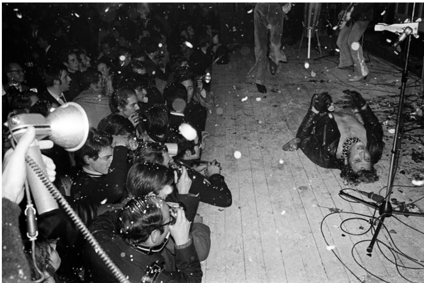
15 November 1967 – Paris, France – Johnny Hallyday on the stage of the Palais des Sports in Paris.