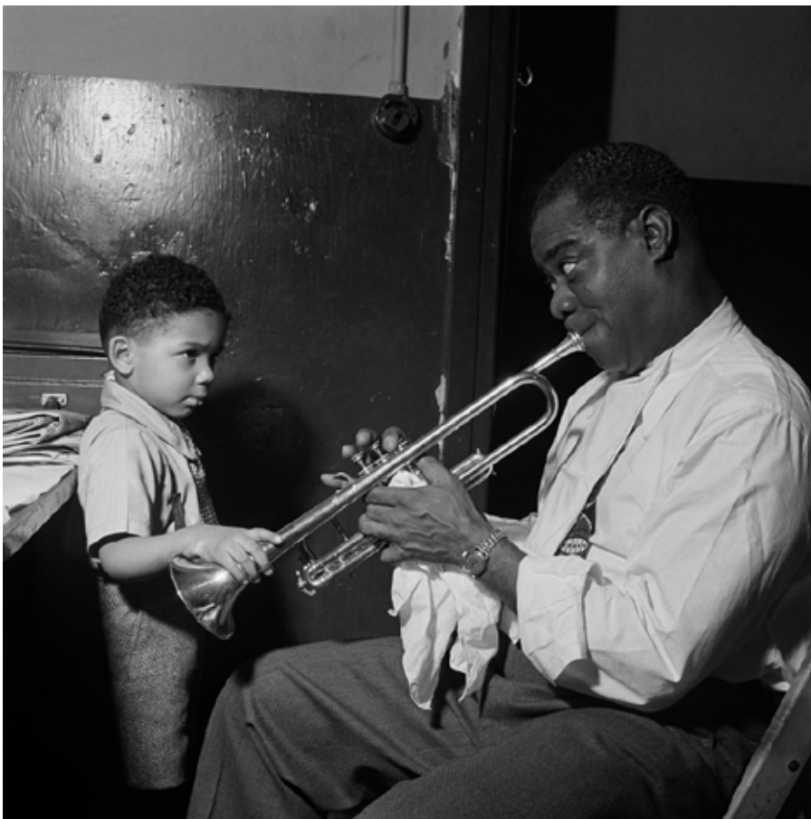
1947 - New York, United States - Louis Armstrong playing in his dressing room for a little boy before performing in a jazz cabaret in New York.