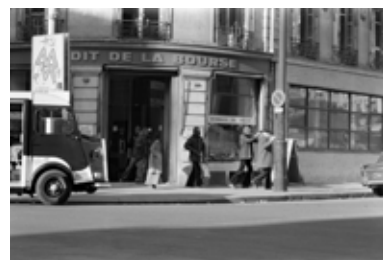
31 January 1974 – Paris, France – At 2.15 p.m., a robbery with hostage taking took place at the Crédit de la Bourse in Paris. The criminals run away with the loot. A customer is wounded during the shooting.