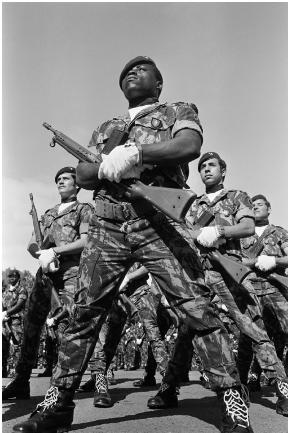
27 July 1973 – Maputo, Mozambique – Training of the Portuguese army special forces at Dondo military camp of Maputo during the Mozambican War of Independence.