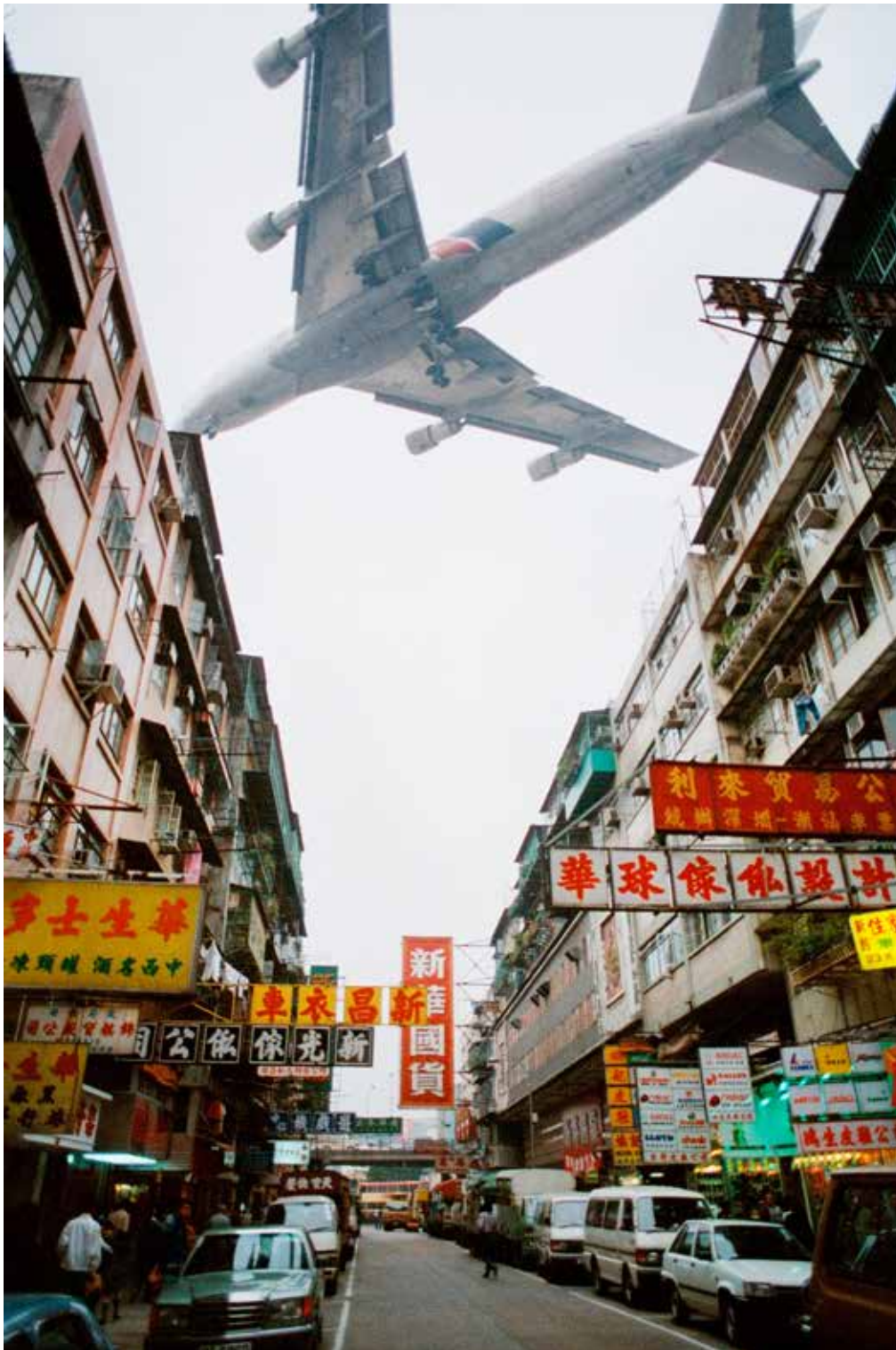
06 April 1988 – Kowloon, Hong Kong – An airliner flies over the ageing buildings of Kowloon city, near Kai Tak international airport.