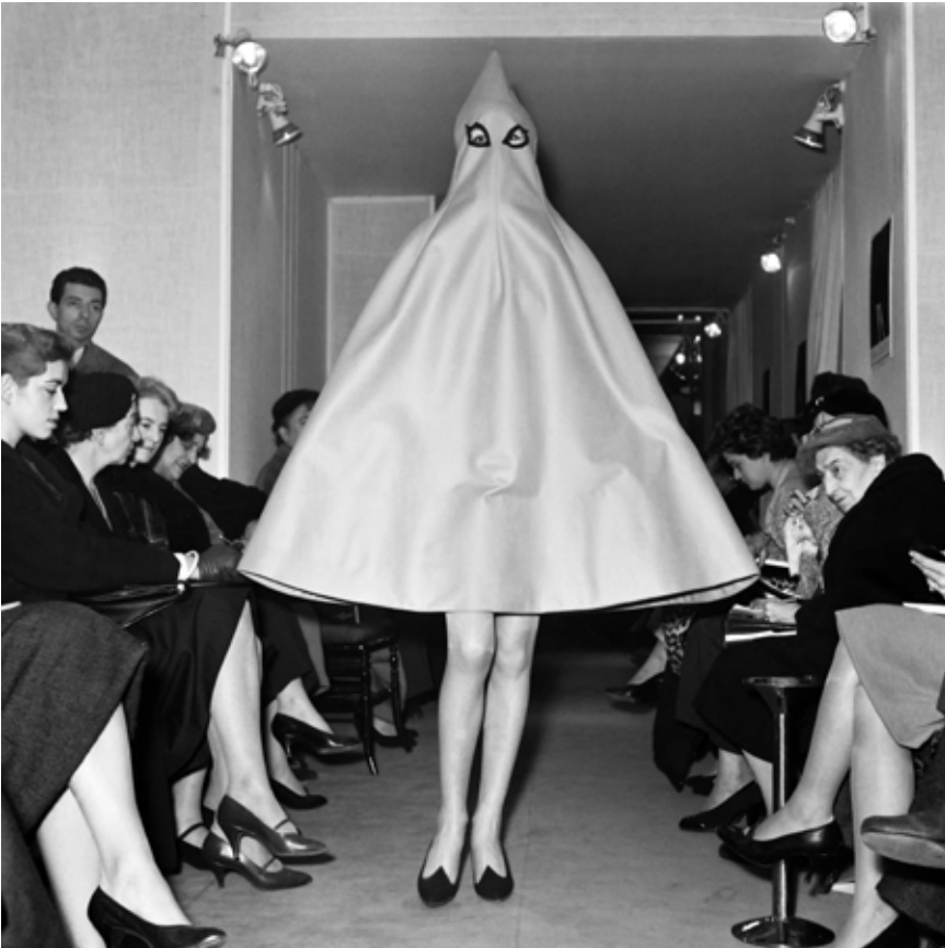
11 November 1957 - Paris, France - Jeanne Lanvin-Castillo fashion show, in Paris.