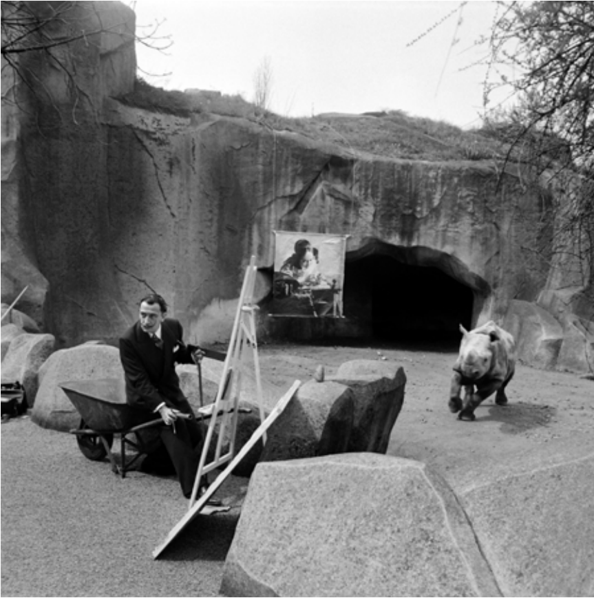
30 April 1955 - Paris, France - Salvador Dalí painting a rhinoceros with Vermeer's famous painting "The Lacemaker" at the Vincennes Zoo.