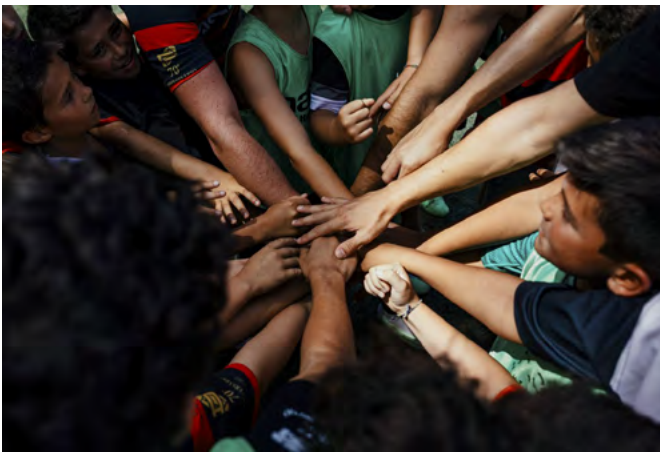
Young players from the ‘Grupo Desportivo Direito’ gather for a training session during the Law Summer Academy in Lisbon, on July 11, 2023. The group was founded in 1952 by a group of university students from Lisbon Law School.

Press photos are available upon request, to be used exclusively for the promotion of this project. Authorised usage includes a maximum of 3 photos, with mandatory credit and caption attribution.