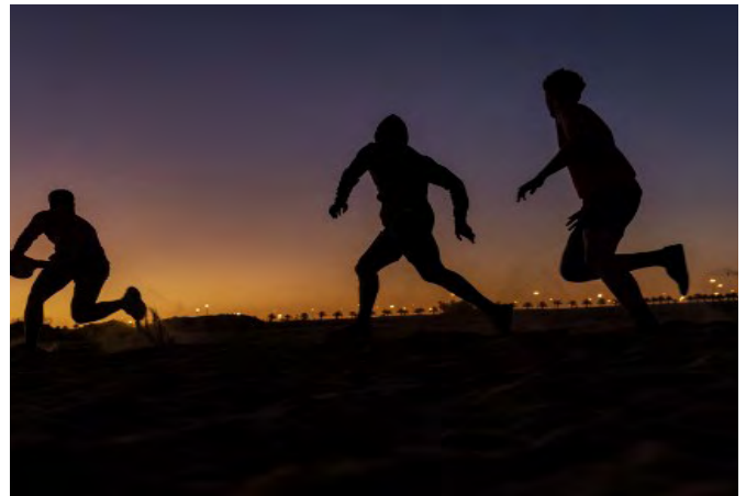
Silhouettes of the FNB Kudu Rugby Club players are seen as they engage in an attack-and-defend drill during a training session in Narraville, Walvis Bay, Namibia, on May 29, 2023.